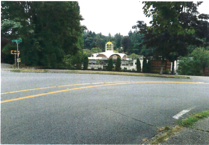
Existing conditions looking south on 19th Ave E at E Lynn St