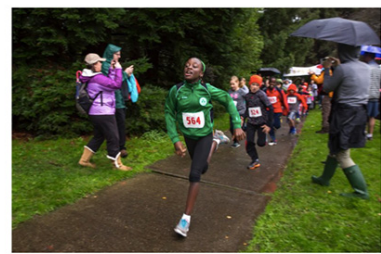
A runner makes a splash during the event.

Local News | Photo & Video | Photography Montlake Turkey Trot: off and running for a good cause Originally published November 24, 2016 at 6:35 pm | Updated November 24, 2016 at 7:22 pm